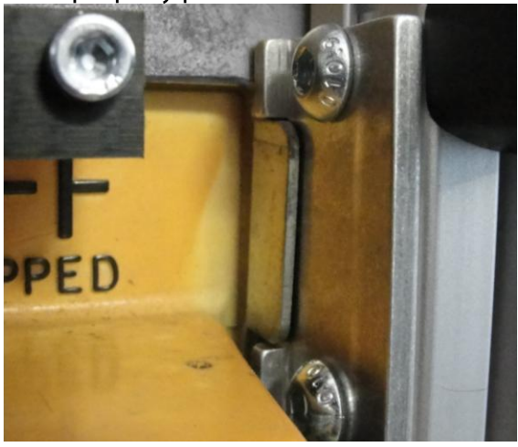
The RSA-57V is now ready for remote operation

4. Ensure that the switch locator is properly positioned over the bucket's interlock device.