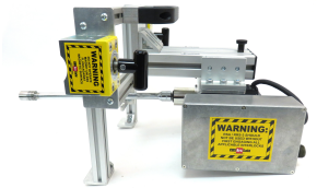
RRS-3 SecoVac (IEEE)

The CBS ArcSafe RRS-3 system allows technicians to remotely rack in or out of low- and medium-voltage power circuit breakers while standing up to 300 feet away. The RRS-3 SecoVac (IEEE) is designed for the General Electric SecoVac VB2+ vacuum circuit breakers with current ratings from 1200–3000 A. Typical usage of the VB2+ breaker is for control and protection of medium-voltage transmission and distribution systems. The RRS-3 DB-50 is designed for DB-50 and DBL-50 air circuit breakers designed by Westinghouse with current ratings of 200–1600 A. Typical usages for DB- and DBL-style breakers cover low-voltage power distribution and branch circuit protection.